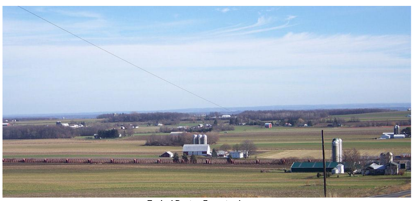
Typical Benton Farmsteads