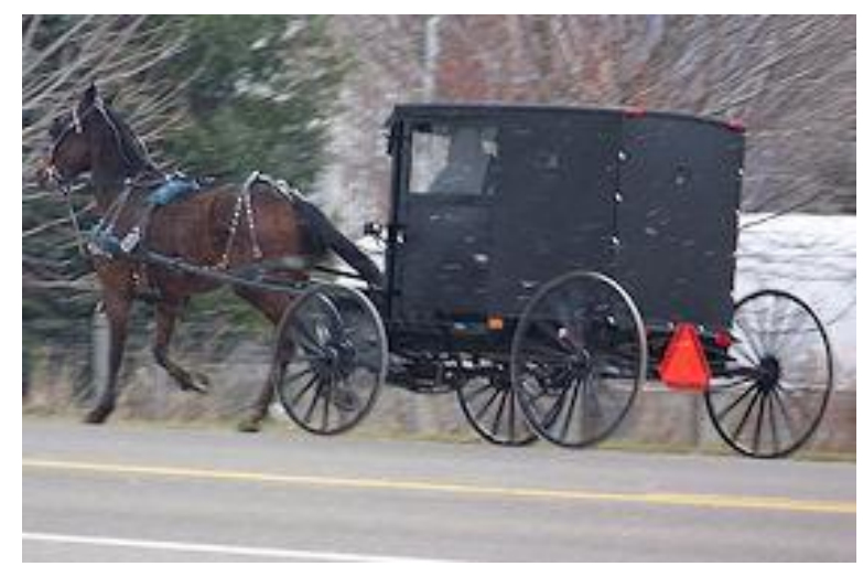
Mennonite Family on NY Rt 14A

from 21,459 in 1980 to 25,348 in 2010 or 0.6% per year.