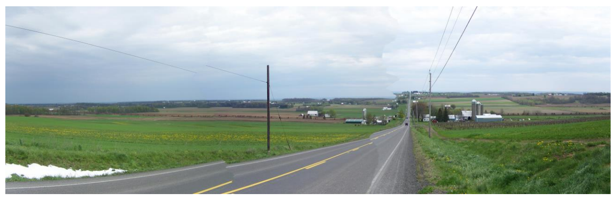
Typical Benton Landscape

Benton's approximately forty square mile land area is located in the northeastern corner of Yates County. New York State Routes 14 and 14A traverse the central and lakefront areas of the Town, connecting it with Geneva and Routes 5 & 20 to the North and with the Village of Penn Yan, the Yates County seat, to the South. The northern portion of the Village of Penn Yan is located in the Town of Benton.