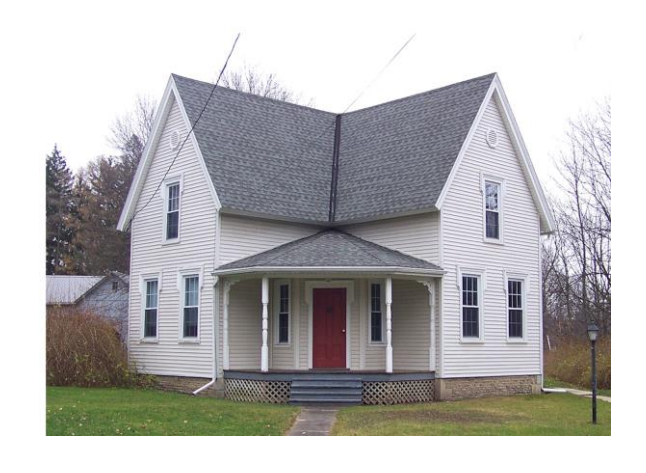
Eli Wood Y-shaped house 1849 (87 Pre-emption Rd Bellona)