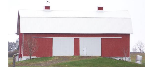
Barn with double cupolas 1880's (1898 E. Havens Corners Rd)