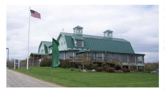
Fox Run Vineyards Rt 14

There are currently no super markets within the Town. Residents shop for food at the two supermarkets located on