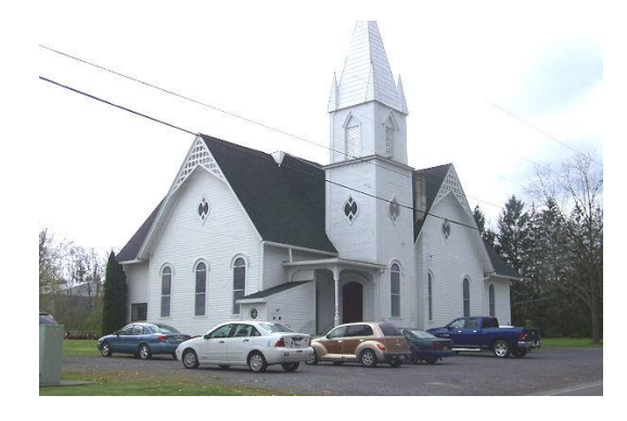
Benton Methodist Church 1855 (Route 14A Benton Center)